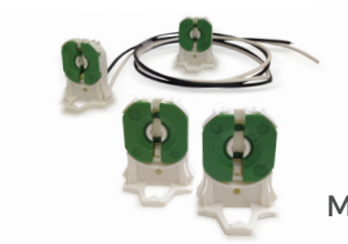
Must use non-shunted lamp holders

For more information please see Accessories section.