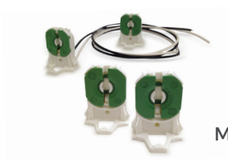
Must use non-shunted lamp holders

For more information please see Accessories section.