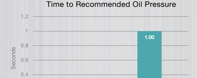
Faster Time to Pressure = Reduced Engine Wear The HUBB Filter has been specifically engineered to achieve oil pressure faster at start-up.