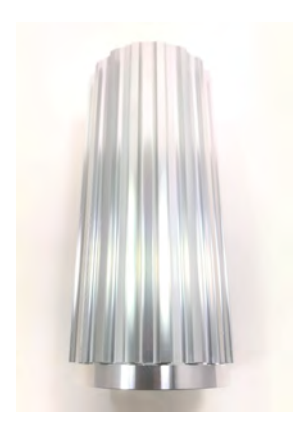
Install filter on engine