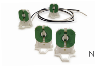
Non-shunted lampholders included